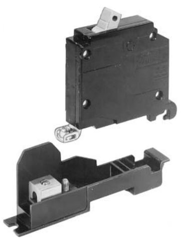
Table 3-5. CHB Mounting Bases

QCR and QCF Breakers provide a 50% space savings over 1-inch per pole designs of the same rating.